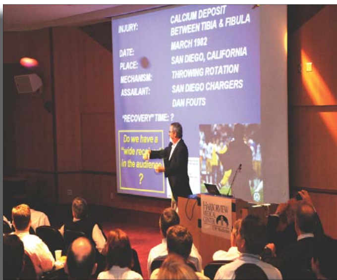
And, he can still throw

Fouts retired from the NFL after 15 seasons with the Chargers, a six-time Pro Bowl selection and many time trauma victim. During the talk, he described his injuries, including a concussion, and identified the perpetrators of the crimes. His years as pilot of the "Air Coryell" offense led to 42 team and 8 NFL records, including most 300-yard passing games. He was NFL and AFC Player of the Year in 1982, and the AFC Most Valuable Player in 1979. Dan Fouts was inducted into the Pro Football Hall of Fame in 1993, after being elected in his first year of eligibility, with all his marbles. He's smart, quick, funny, and knows a lot about trauma.