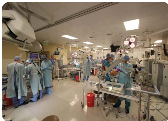
Everyone gets a turn...

These courses are an invaluable educational opportunity for our residents.