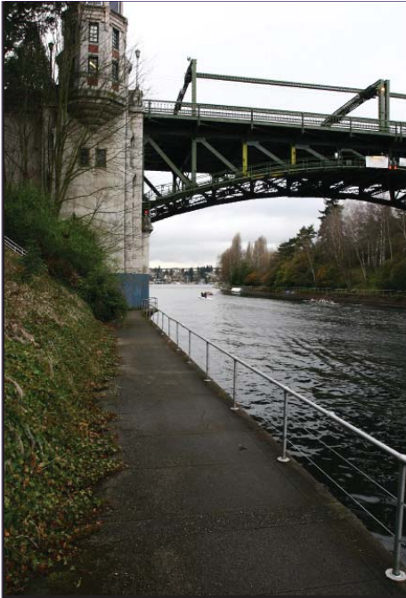
The Montlake Cut