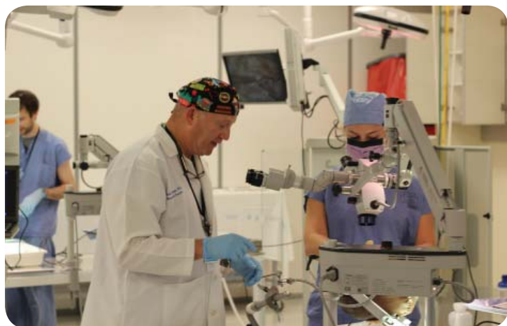
...Even the Boss...