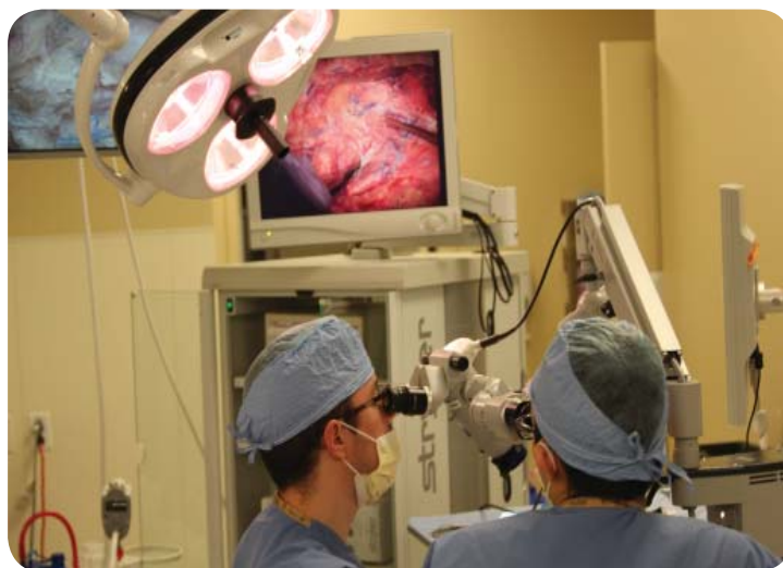
...And the juniors