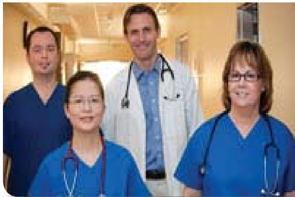
Valley Medical Center

The chief executive officers of UW Medicine and Valley Medical Center (VMC) have announced the formation of a strategic alliance in which Valley Medical Center, Public Hospital District #1 of King County, will join UW Medicine effective July 1, 2011. The creation of this alliance follows several months of in-depth due diligence, discussion with respective boards, communication with key stakeholders, and preparation of a strategic alliance agreement, which was approved by the governing boards of both organizations.