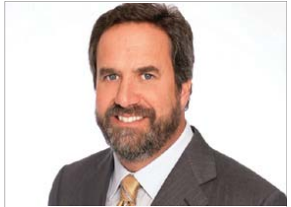
Dan Fouts, QB

A former All-Pro San Diego Charger quarterback and NFL Hall of Famer, Fouts returned to CBS Sports as an analyst in August 2008. For almost ten years before that, he worked for ABC Sports alongside the legendary broadcaster (and Cougar) Keith Jackson. He was also the play-by-play announcer for ABC's coverage of Pac-10 college football for several years.